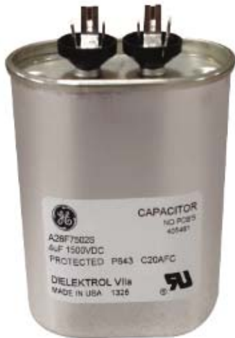
1500 and 2500 Volts Peak

This line of General Purpose DC Capacitors is made with film dielectric technology for 1500V and 2500V ratings. These capacitors are typically used in DC filters at voltages above those served by electrolytic type construction