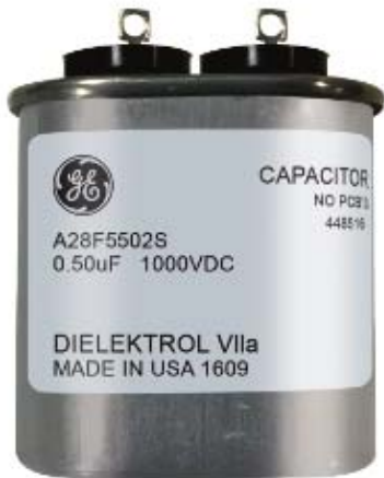
A28F5000S 1000 and 2000 Volts Peak/Max DC

The A28F5000S series of Snubber Capacitors are designed for use in power semiconductor circuits to protect the semiconductor by limiting the rate of voltage rise.