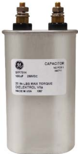
97F7500 250 Volts Peak

The 97F7500 Series is a special purpose line designed for applications where a large micro-farad value at low voltage is required in a small size. The dielectric system is self clearing metallized polypropylene. Typical applications are in SCR chopper circuits and low-voltage ac filters