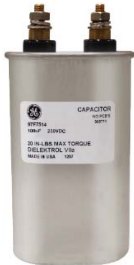
A97F8600 / A97F8700 Series 600 to 1500 Volts Peak

This family of capacitors is designed for high-current applications, such as (1) SCR commutation, (2) snubbers for SCRs, GTOs and other power semiconductors, and (3) for any other circuits where the combination of frequency and voltage results in high RMS currents